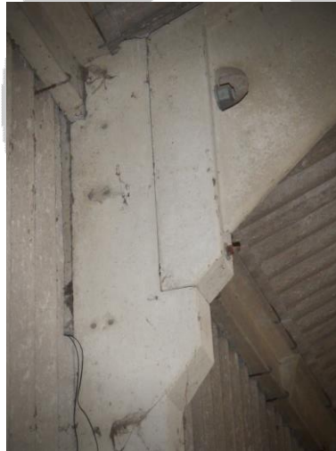
FIGURE 7: ONE OF THE SUPPORTING PIERS SHOWING THE LACK OF ROOSTING SPACES.