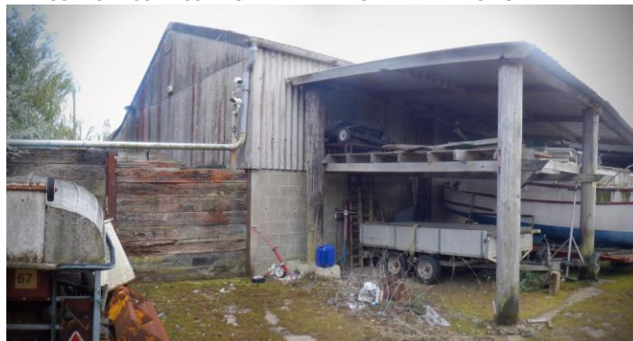
FIGURE 4: THE EXTERNAL STORAGE AREA ON THE NORTHWESTERN SIDE.