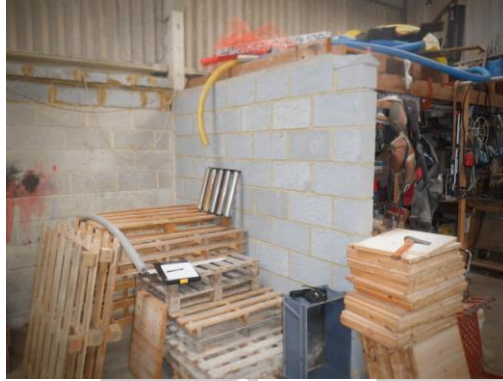
FIGURE 6: THE BLOCK WALL AND AN INTERNAL BLOCK PARTITION.