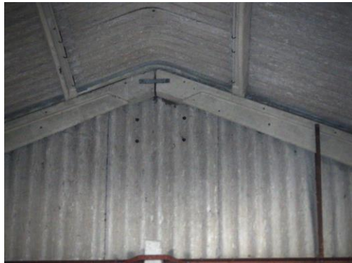
FIGURE 8: THE BEAMS ARE SEVERAL CENTIMETRES PROUD OF THE ROOF AND WALL.