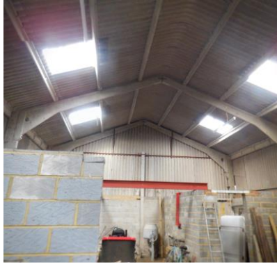
FIGURE 5: SHOWING THE ROOF AND SKYLIGHTS.