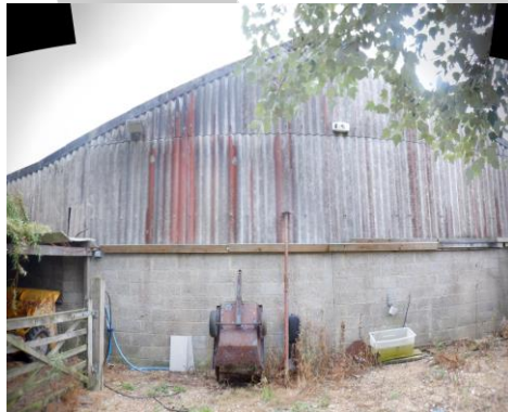
FIGURE 3: A COMPOSITE GENERAL VIEW OF THE EXTERIOR OF THE BARN.