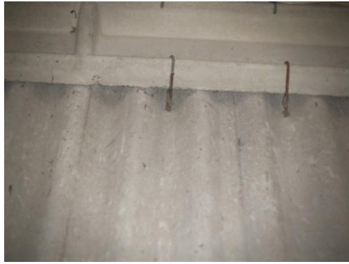
FIGURE 9: THE GAP BETWEEN THE BEAMS AND THE ROOF.