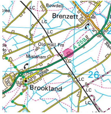
FIGURE 1: THE SURVEY SITE LOCATION.