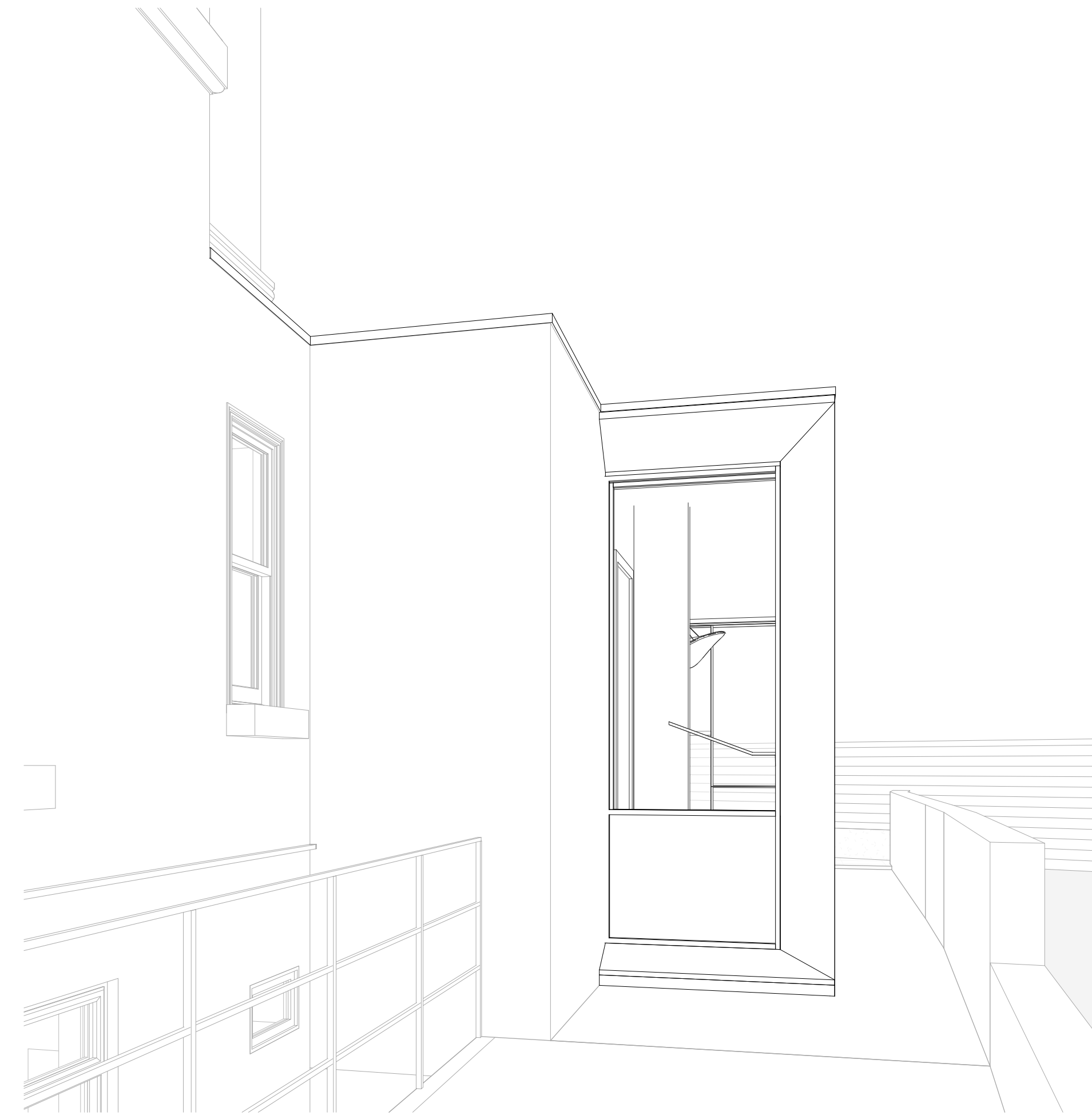
2 Street View Two