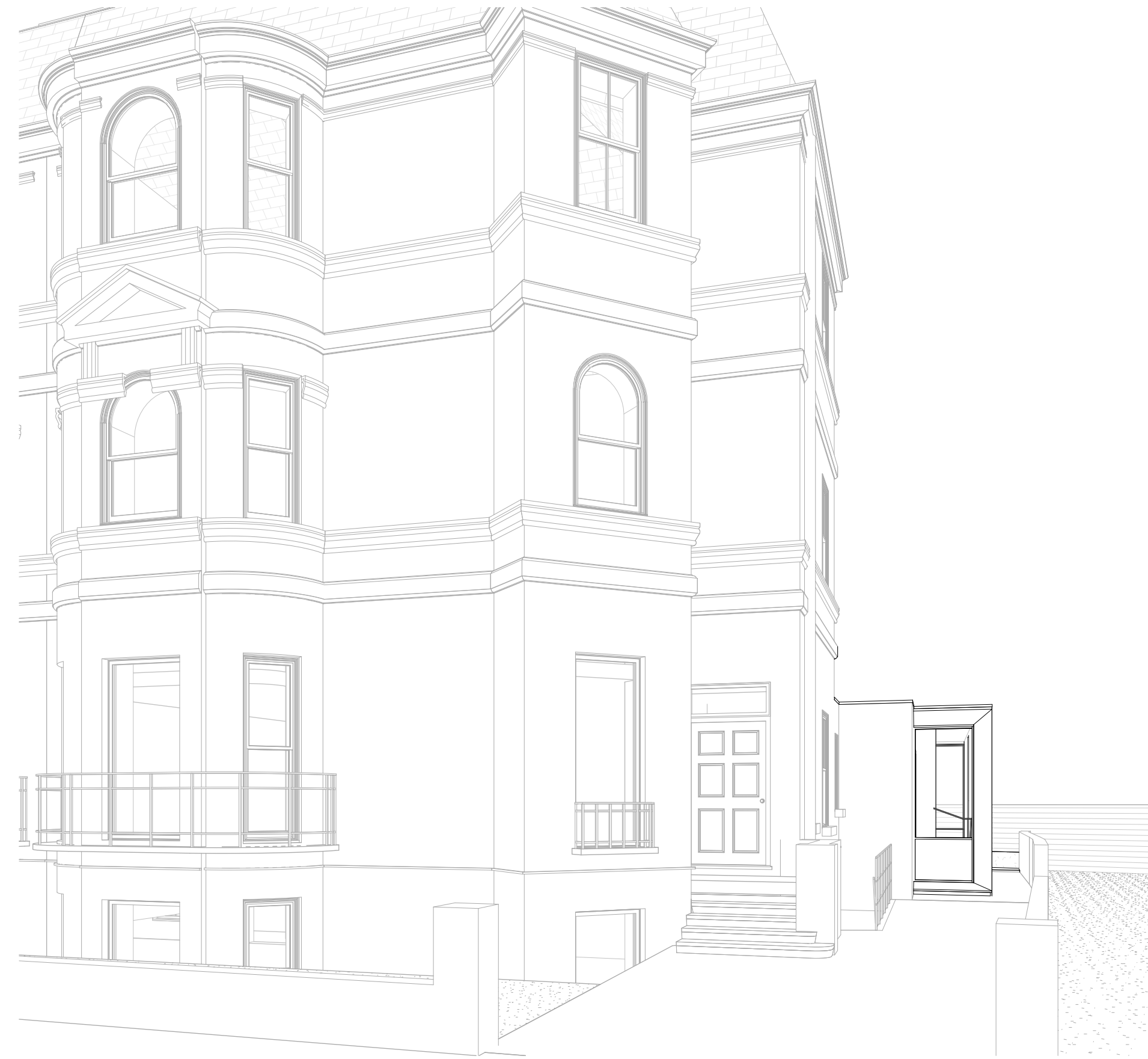
1 Street View One