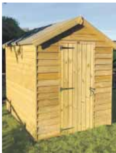
CHART FENCING & SHEDS