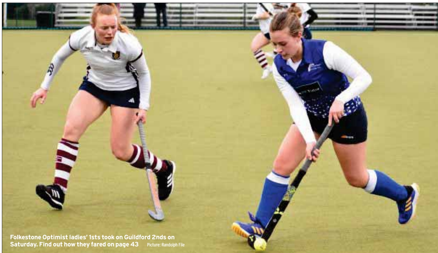
Folkestone Optimist ladies' 1sts took on Guildford 2nds on Saturday. Find out how they fared on page 43