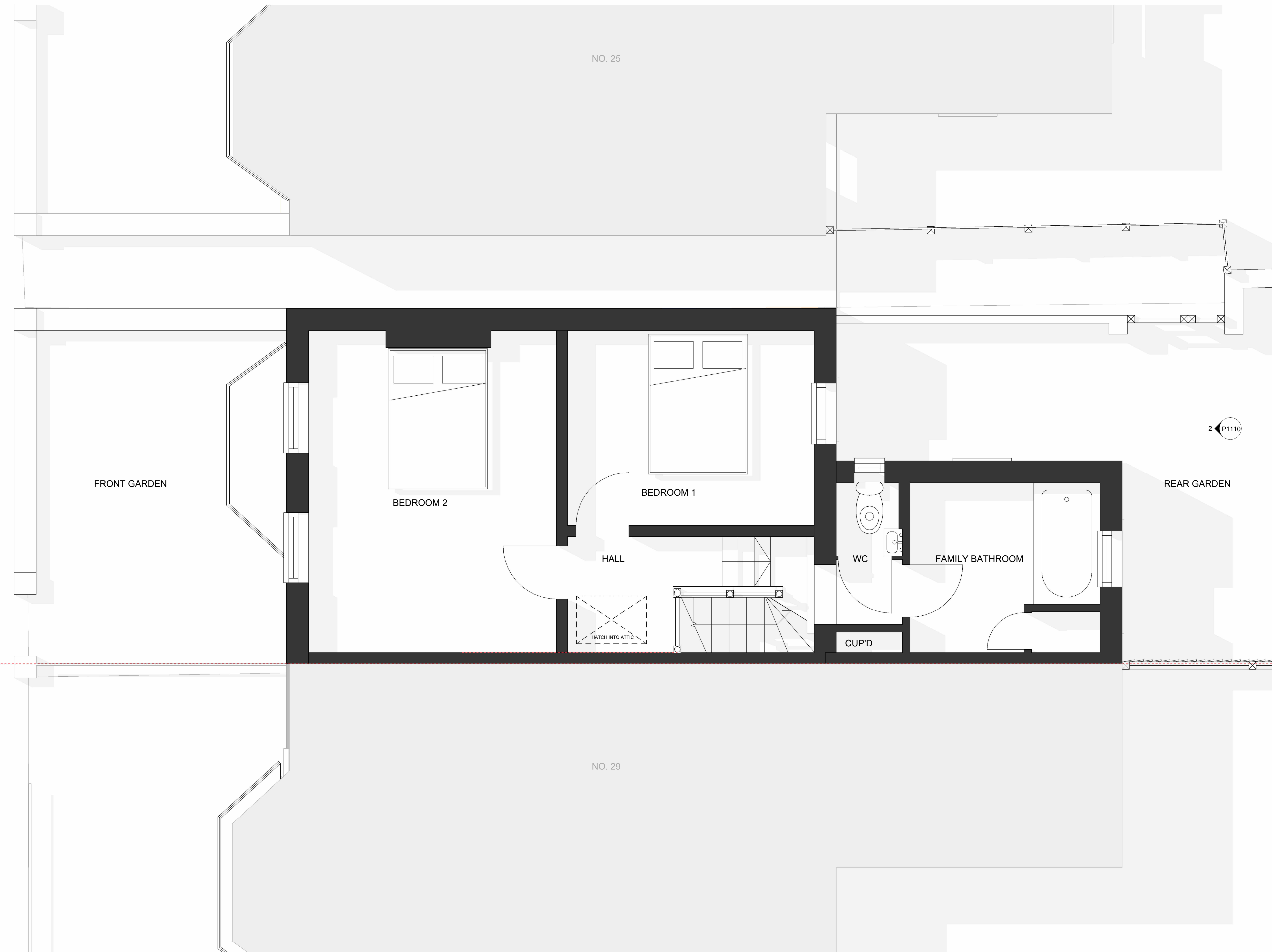
1 FIRST FLOOR PLAN 1 : 25