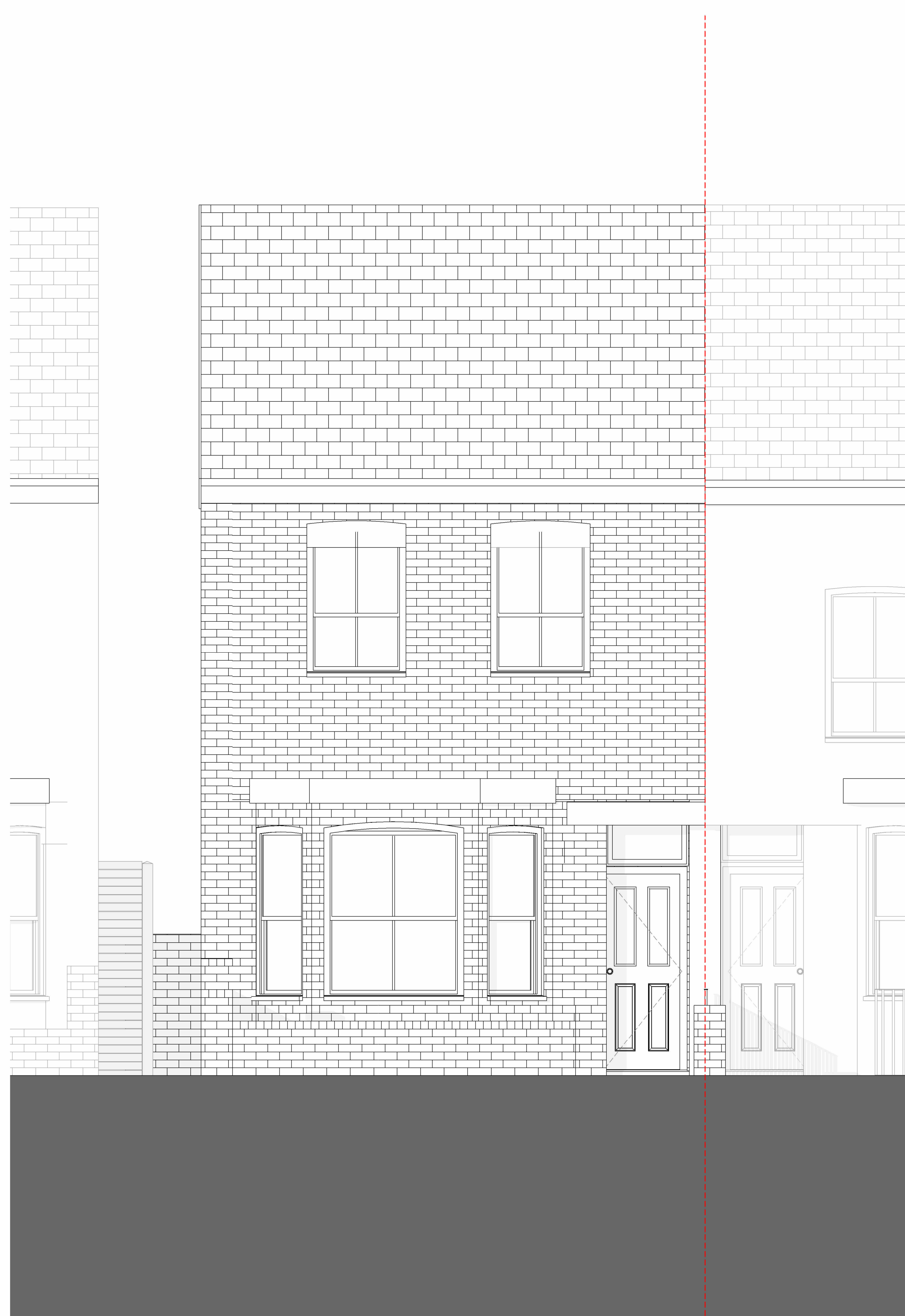
1 FRONT ELEVATION 1 : 25