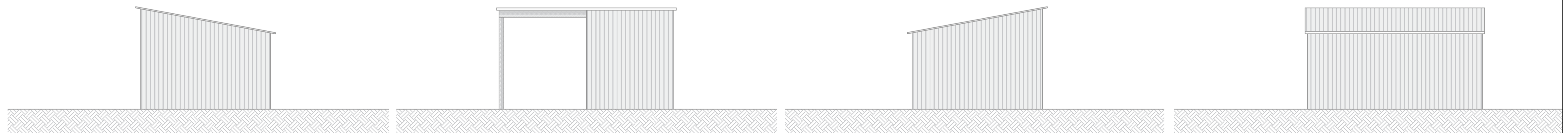
Existing North Elevation @ 1:50