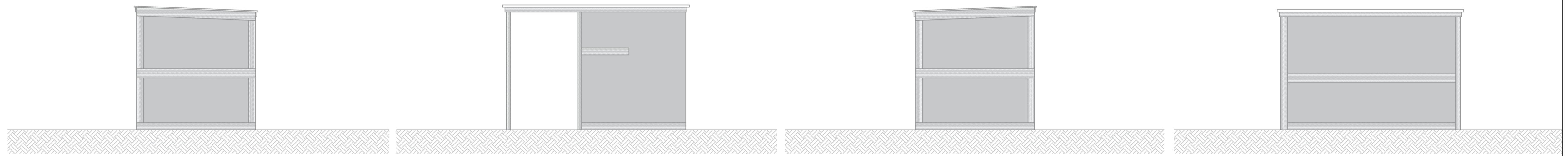
Existing North Elevation @ 1:50