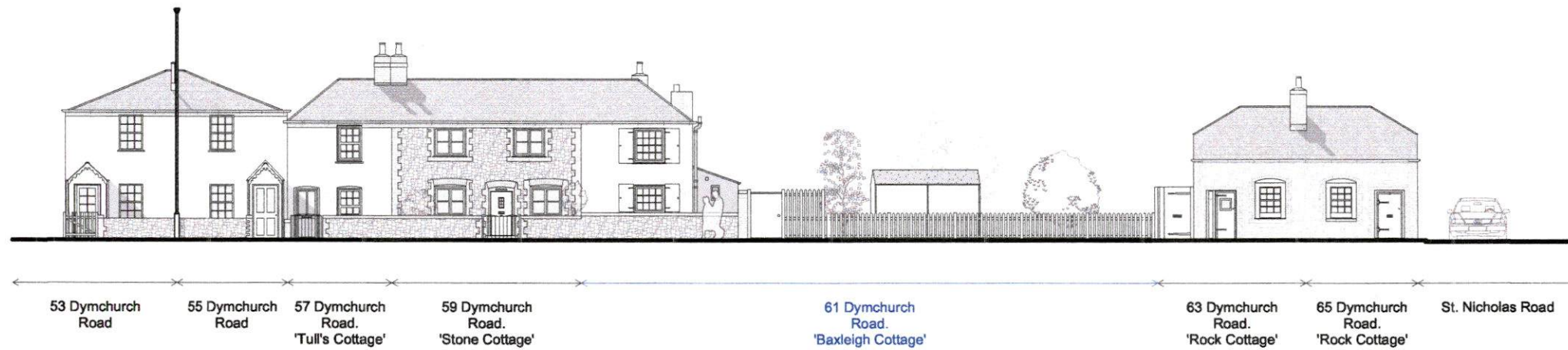
01 Existing North Elevation (Street) Scale: 1:200

— - Ownership Boundary — - Site Boundary