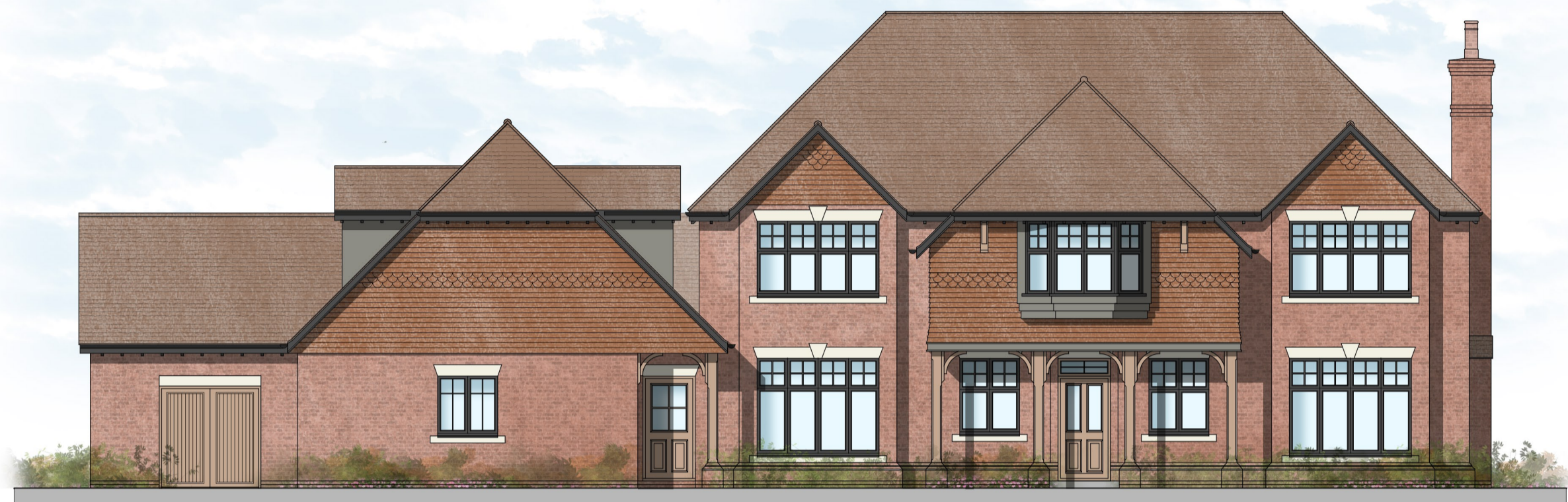
Northern Front Elevation