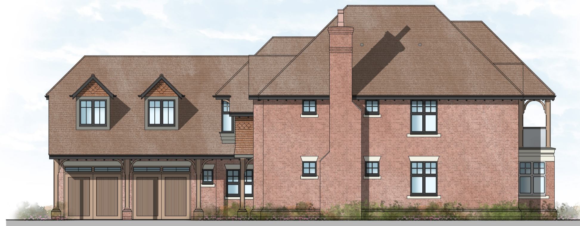
Western Side Elevation