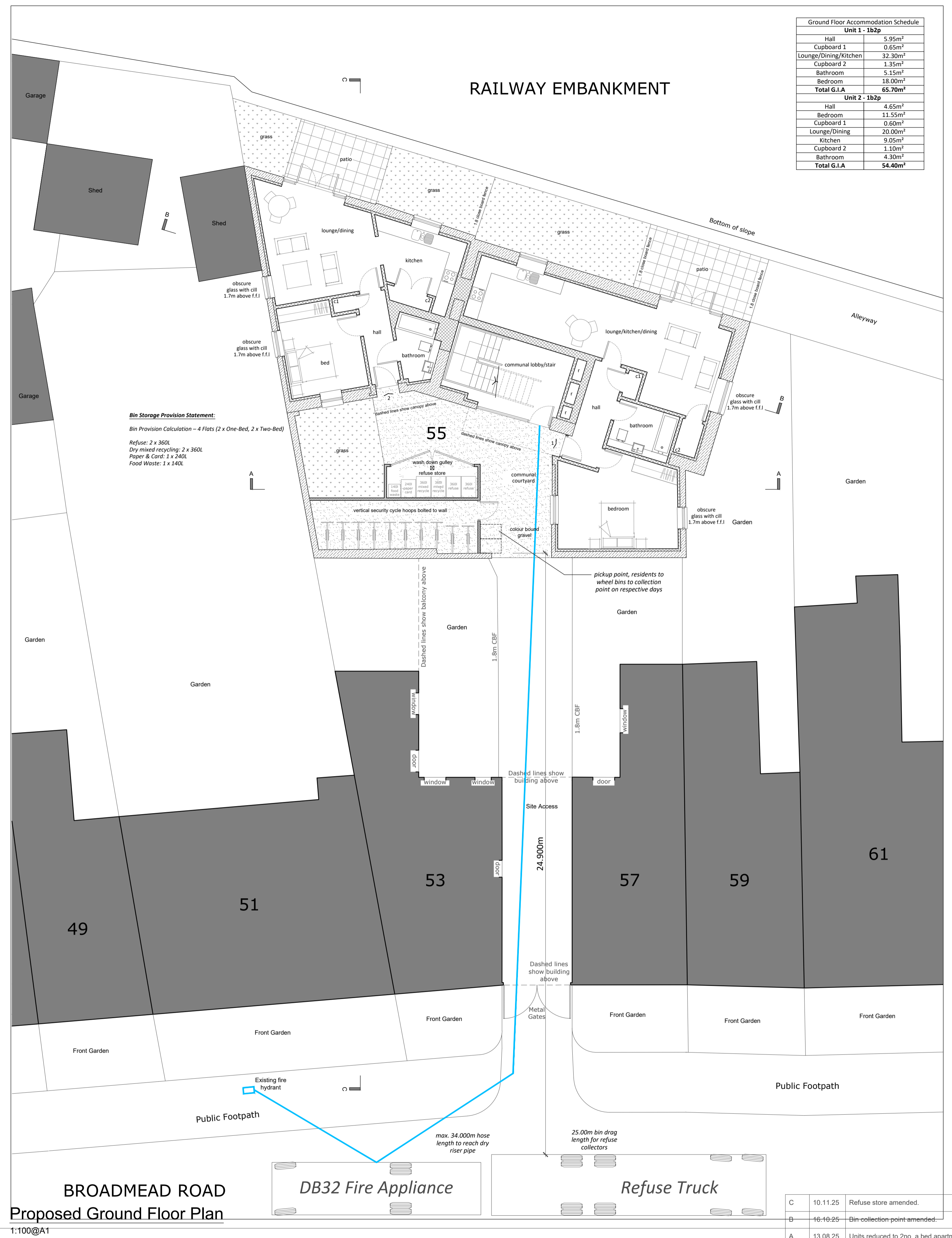
Proposed Ground Floor Plan 1:100@A1