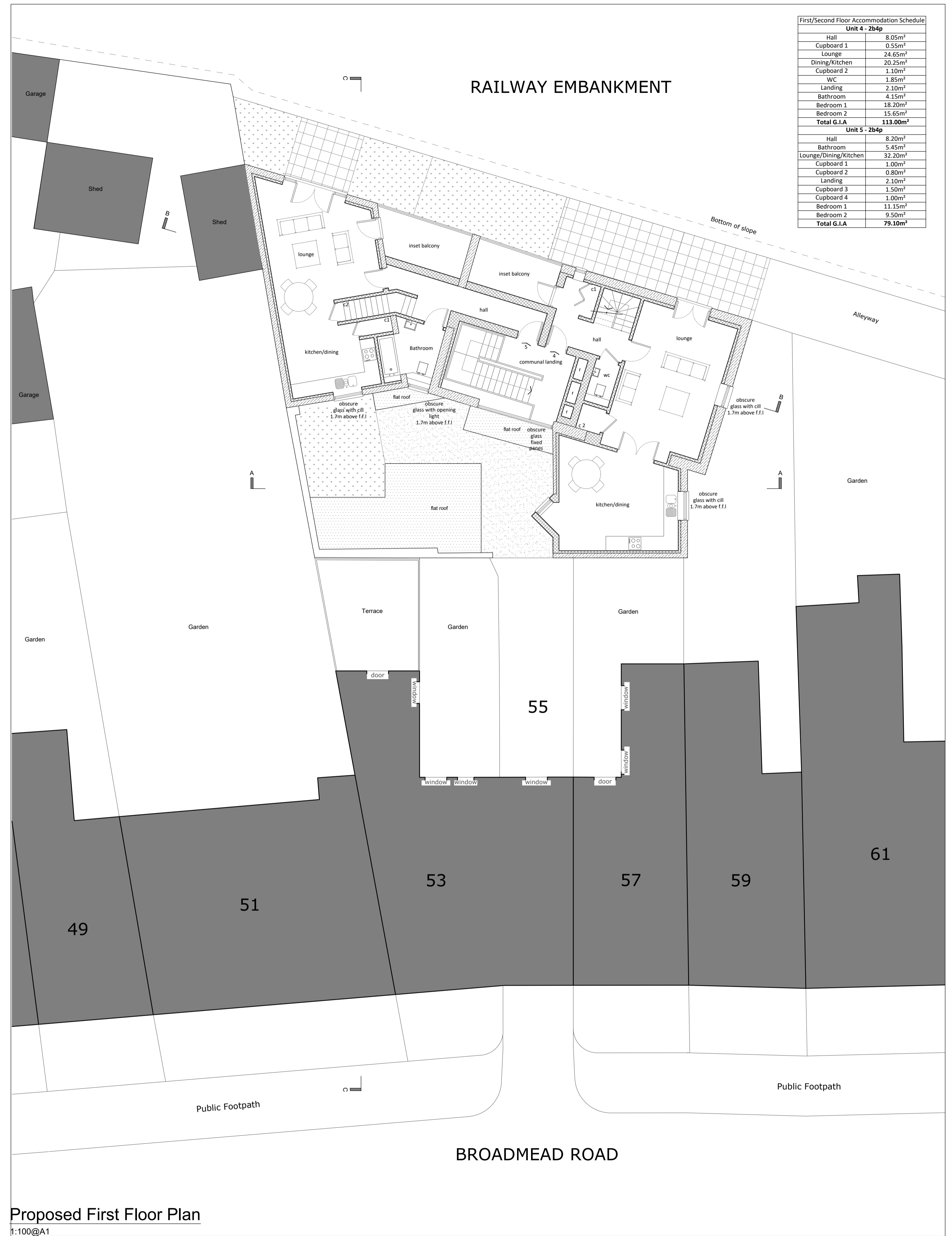
Proposed First Floor Plan 1:100@A1