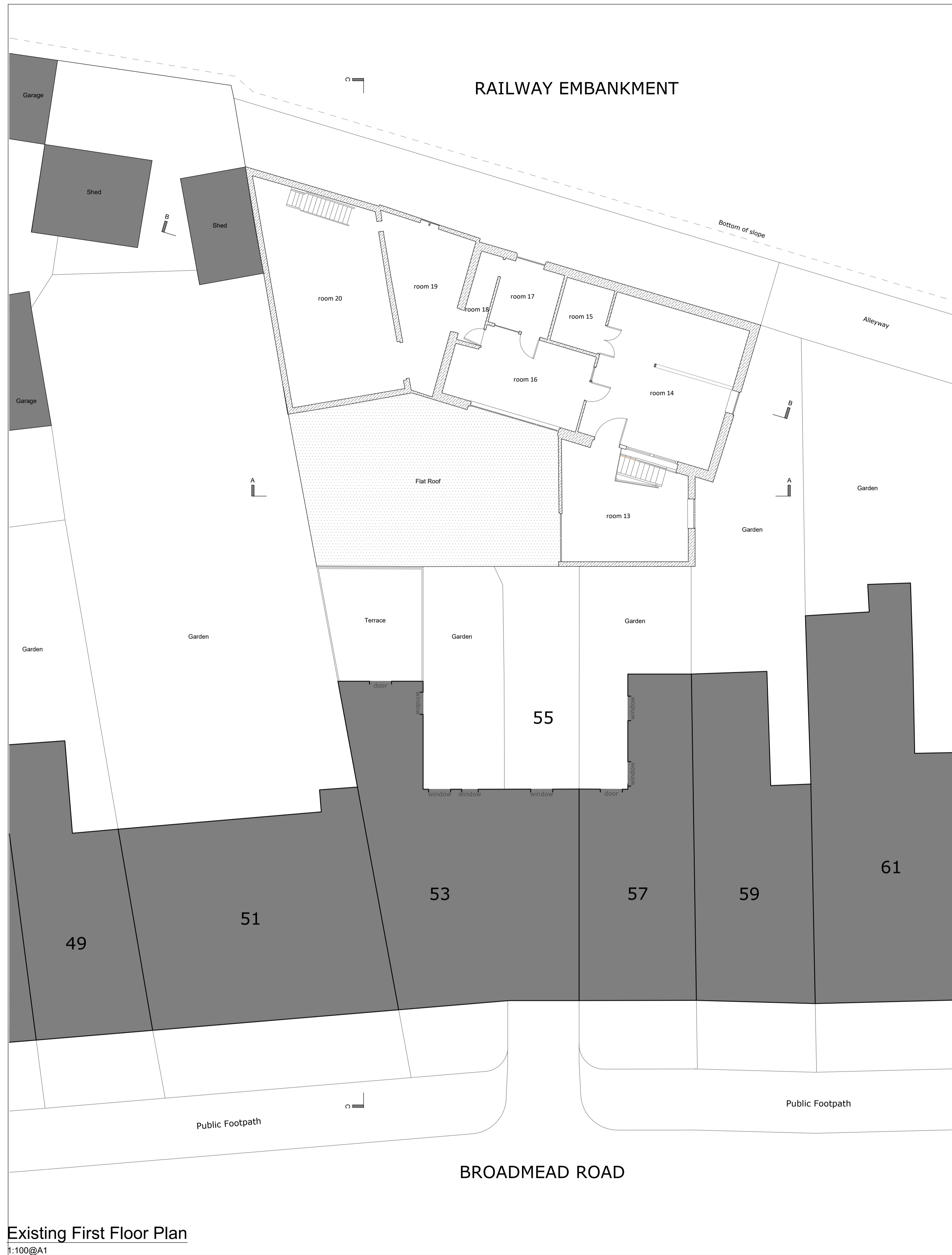
Existing First Floor Plan 1:100@A1