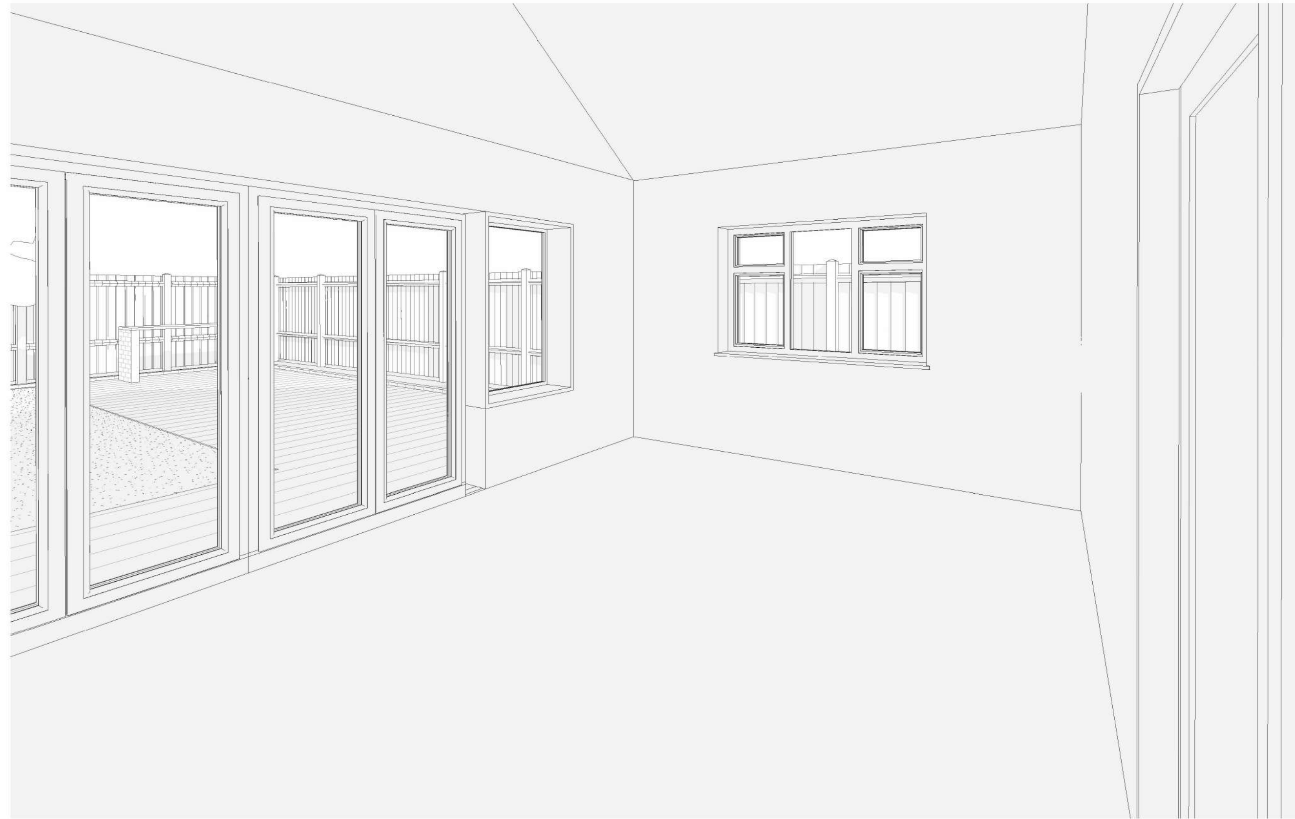
1 LIVING, KITCHEN AND DINING