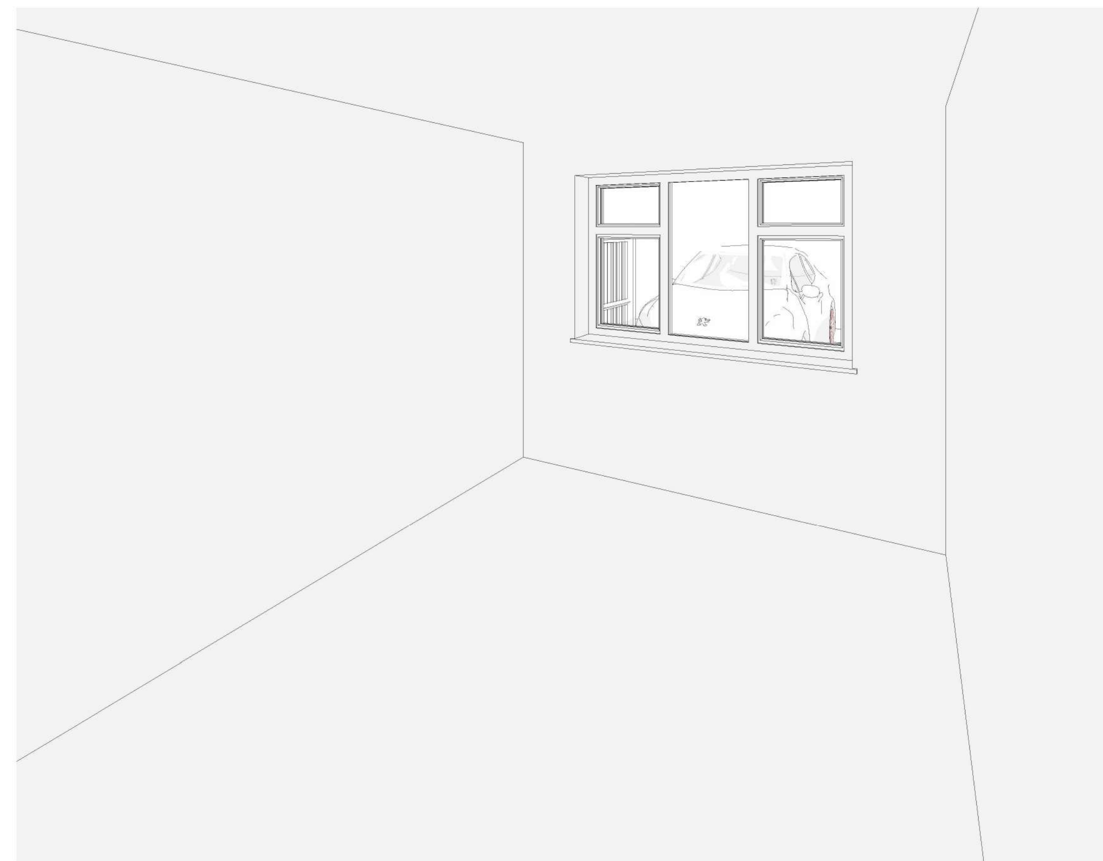
4 BEDROOM 1 VIEW