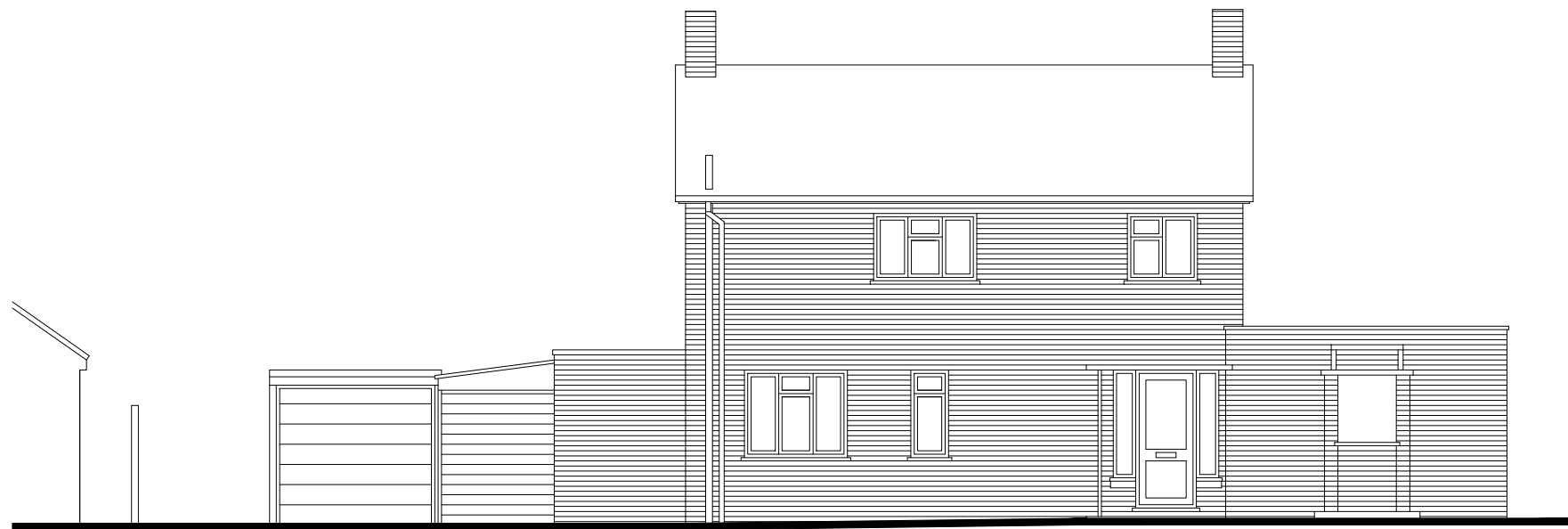
Existing Front Elevation Scale: 1:100@A3