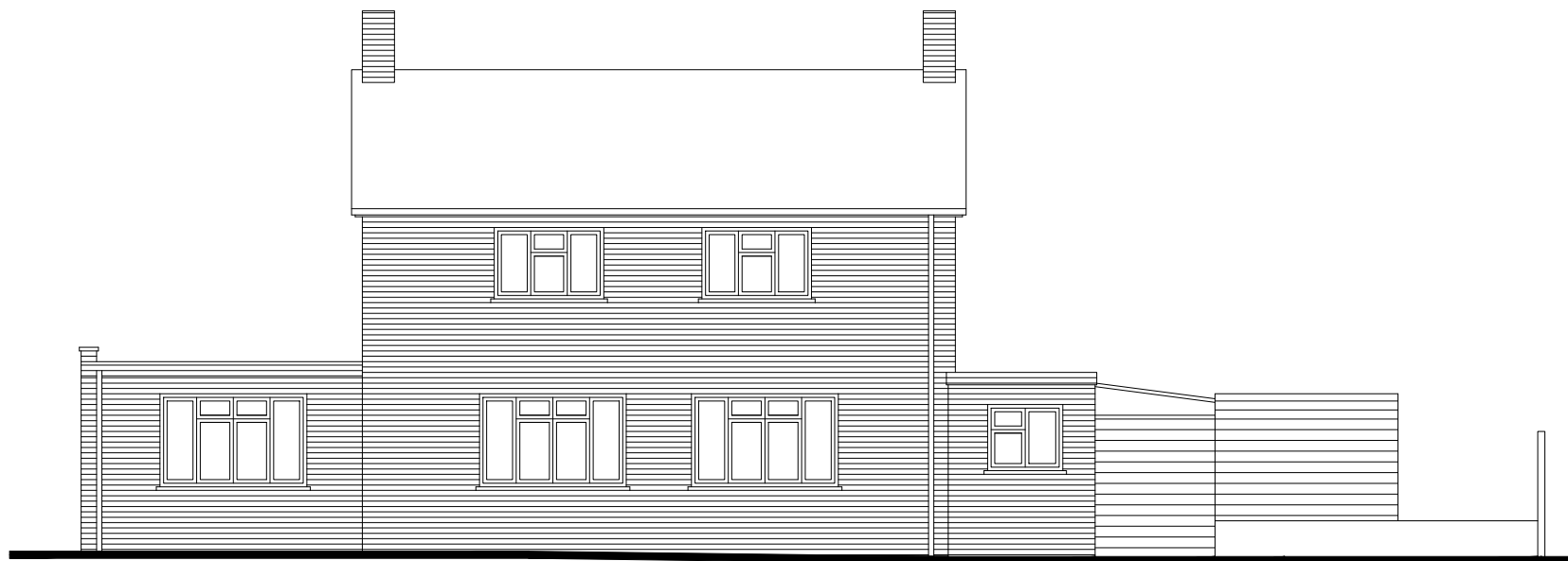
Existing Rear Elevation Scale: 1:100@A3

Roof: Concrete Tiles Walls: Brickwork W&D's: Upvc RW Goods: Upvc