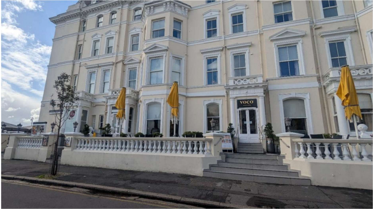
Figure 4: View of Eastern Elevation