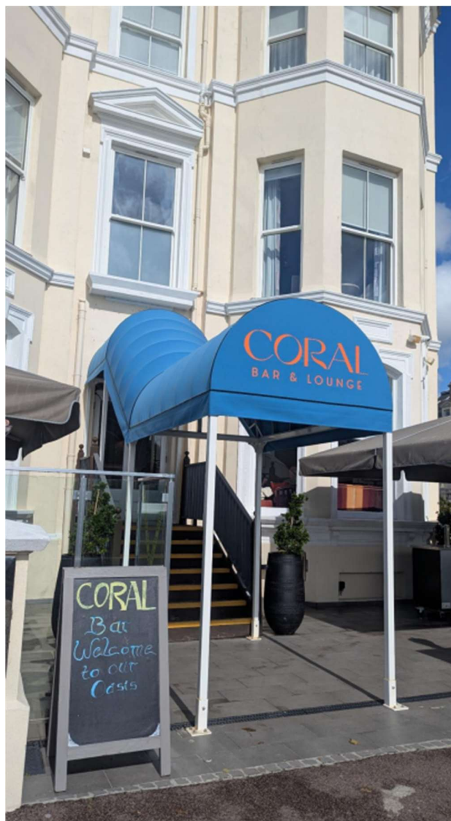
Figure 6: Close up view of canopy