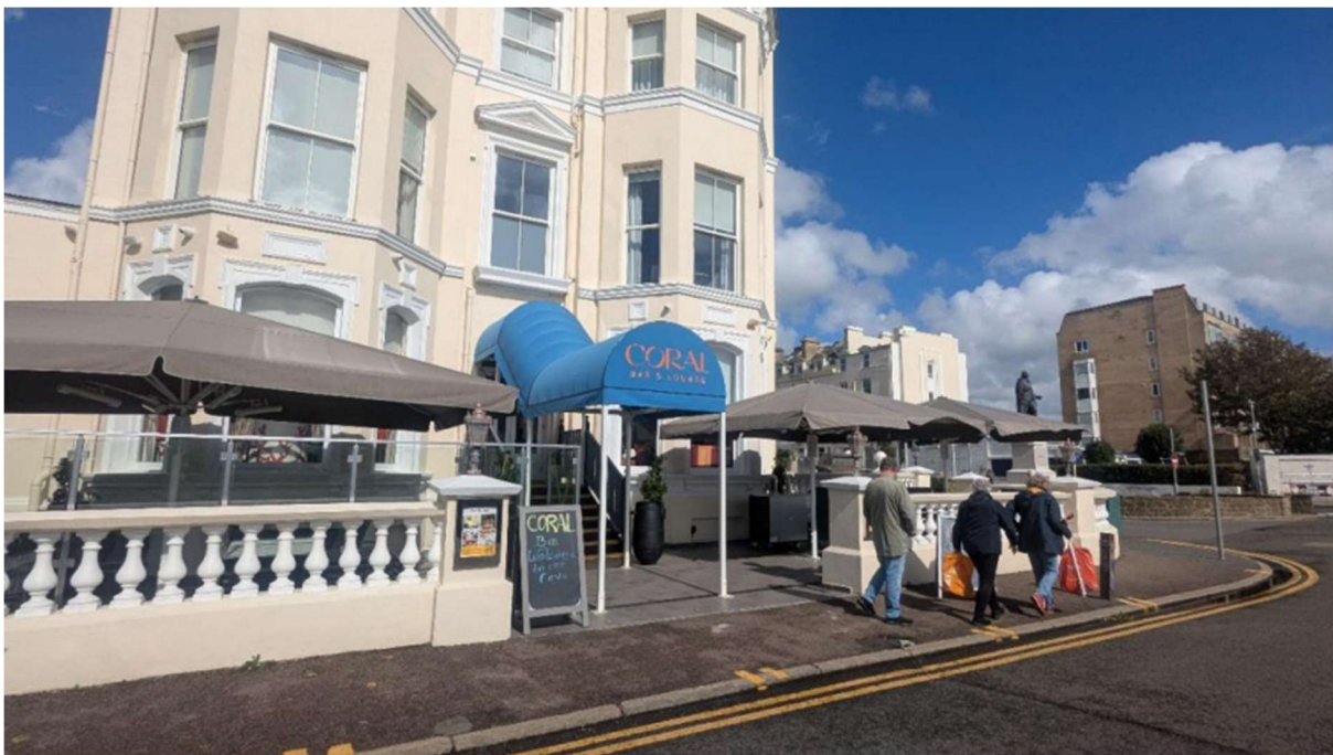
Figure 5: View of Southern Elevation