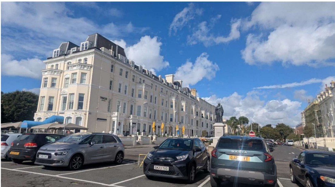
Figure 3: View of site from Leas Promenade