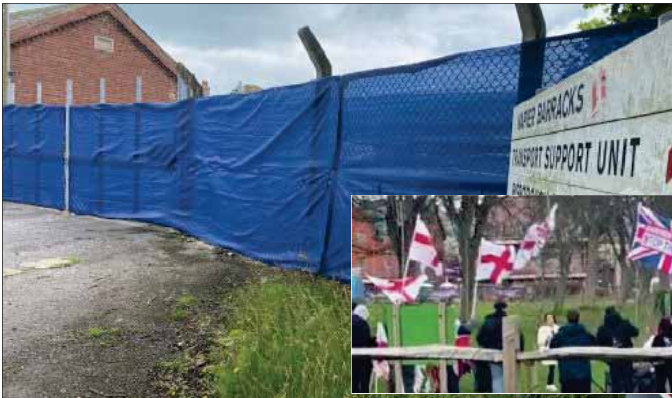
The controversial use of Napier Barracks to house asylum seekers and migrants has come to an end; inset, anti-immigration protesters outside the site during a protest in November