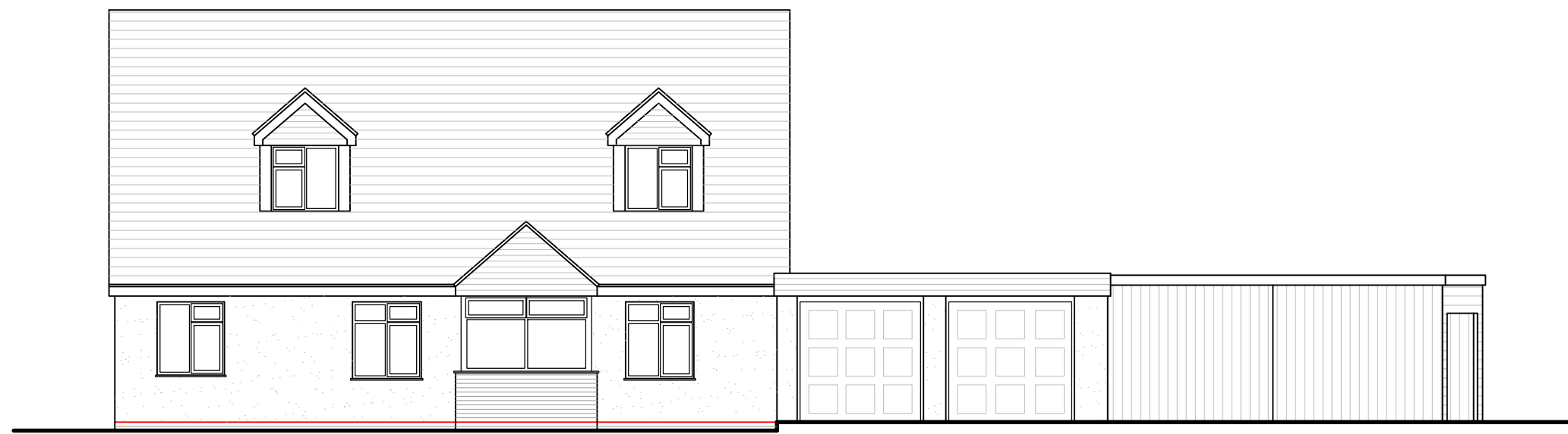
Existing North elevation Scale 1:100

Copyright Notice © 2024 Christian Lawrence Architects Ltd (CLArchitects). All rights reserved. This architectural drawing, including all design elements, specifications, and annotations, is the exclusive property of CLArchitects and is protected by copyright law. Unauthorised reproduction, distribution, or use of this drawing or any part thereof without prior written consent from CLArchitects is strictly prohibited and may result in legal action. For permissions or inquiries, please contact: CLArchitects, Unit 6, Triumph Park, Ross Way, Folkestone, CT20 3TX info@clarchitects.co.uk 01303 647233