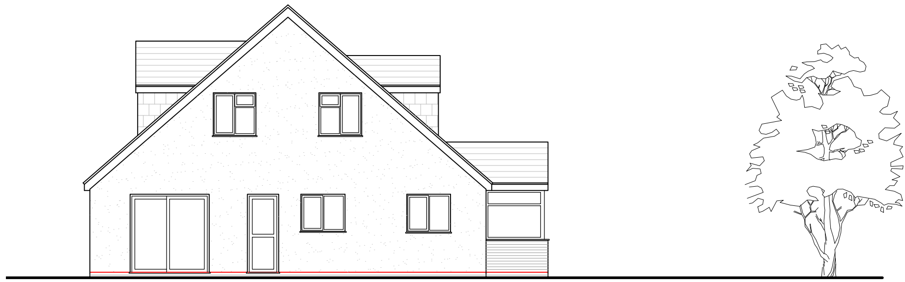
Existing East elevation Scale 1:100