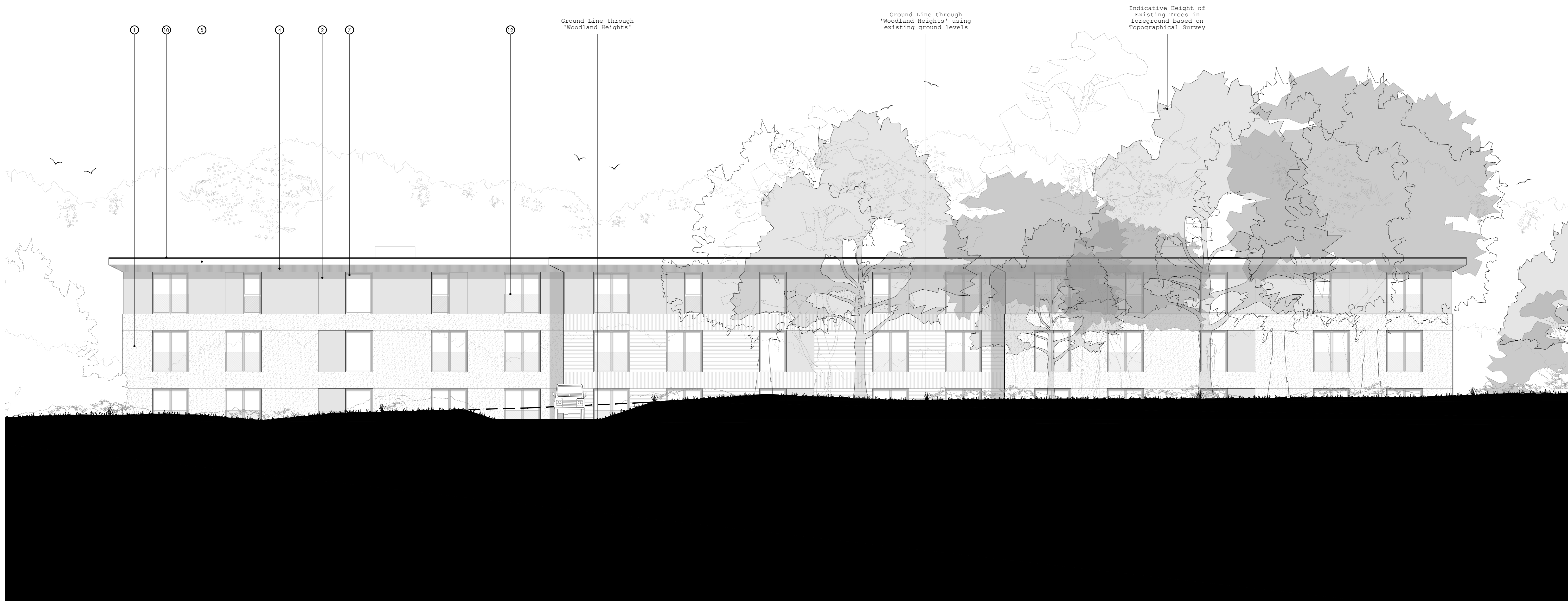
PROPOSED STREET SCENE - NORTH ELEVATION SCALE 1:100 @ A0