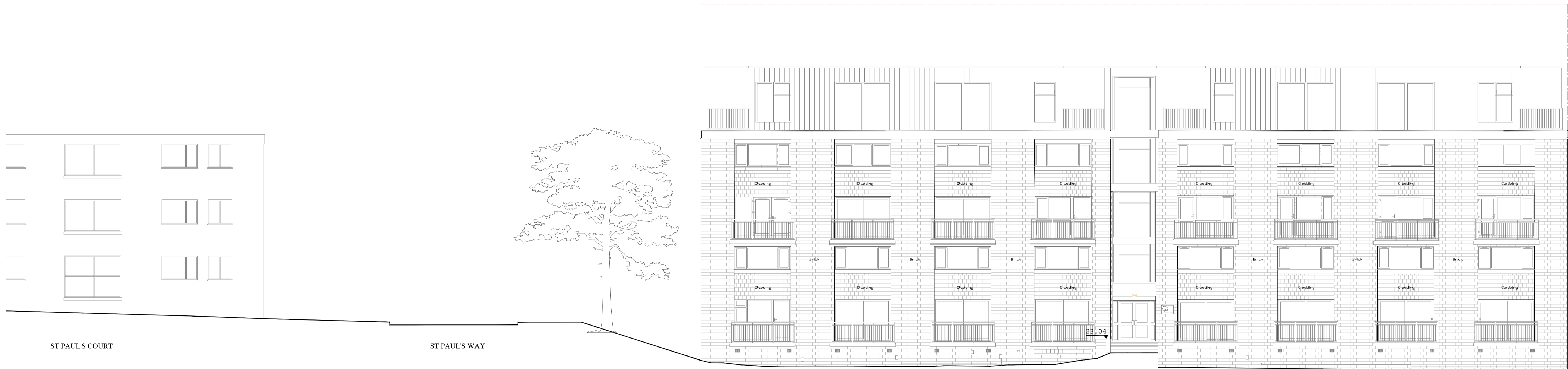
PROPOSED STREET SCENE Scale @ 1/100