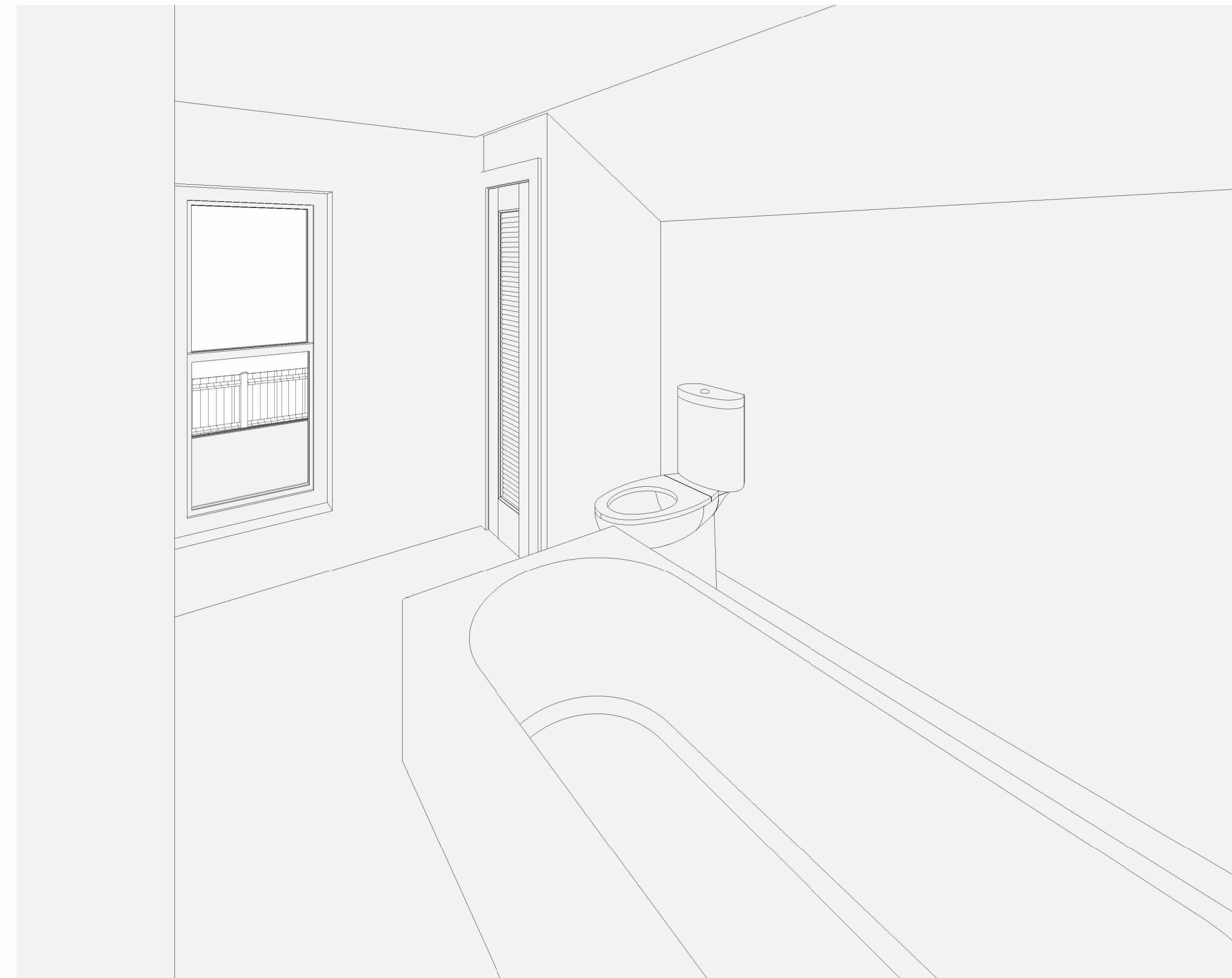
4 FAMILY BATHROOM