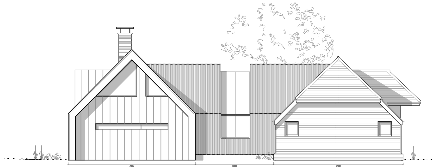
7a Proposed Side Elevation Scale: 1:100