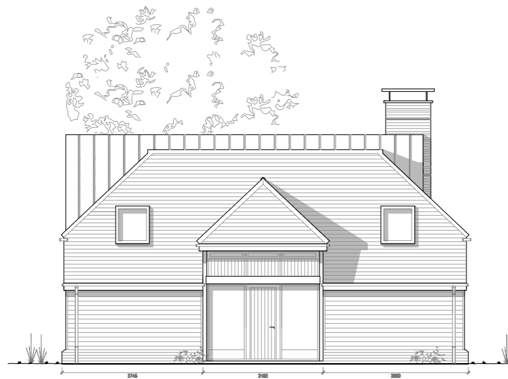
7c Proposed Front Elevation Scale: 1:100