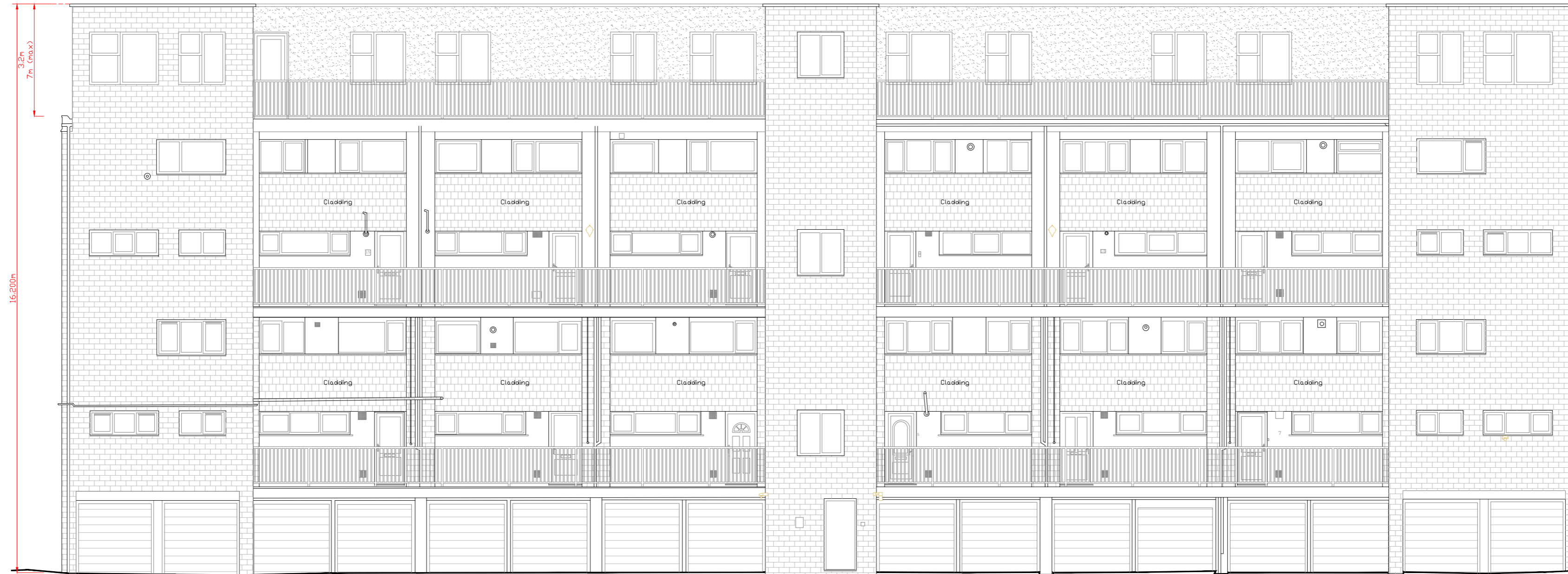
PROPOSED REAR ELEVATION (B) Scale @ 1/100