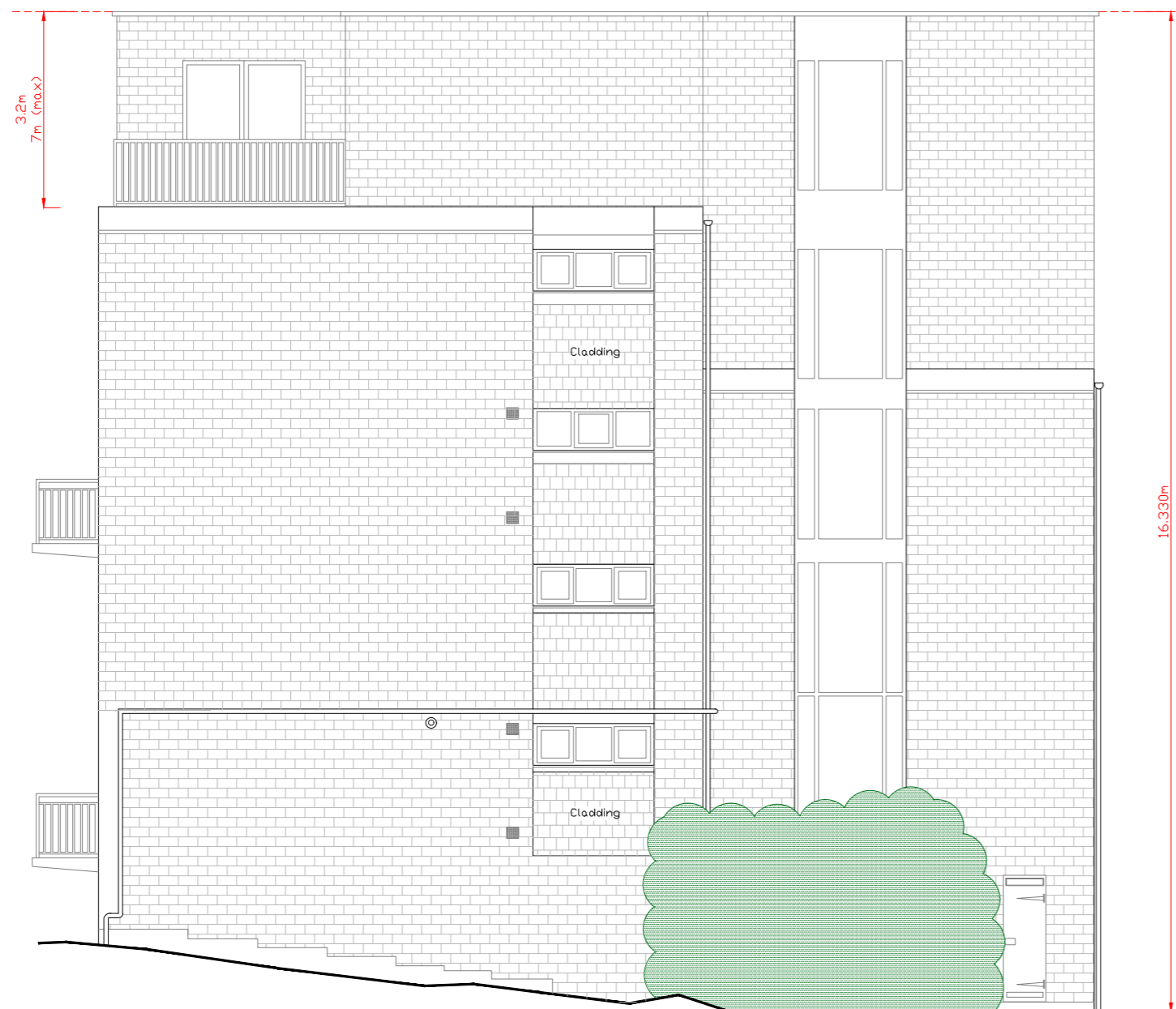
PROPOSED RIGHT SIDE ELEVATION (C) Scale @ 1/100