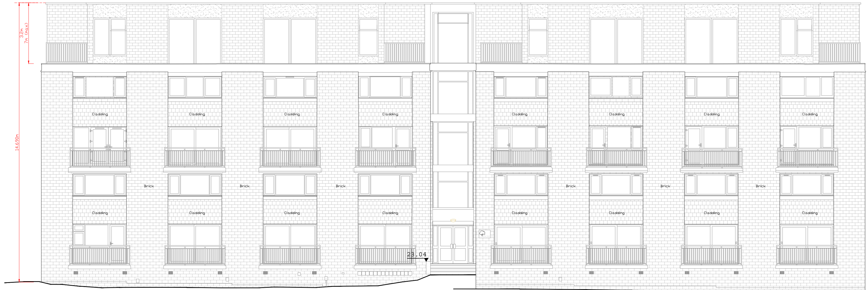
PROPOSED FRONT ELEVATION (A) Scale @ 1/100