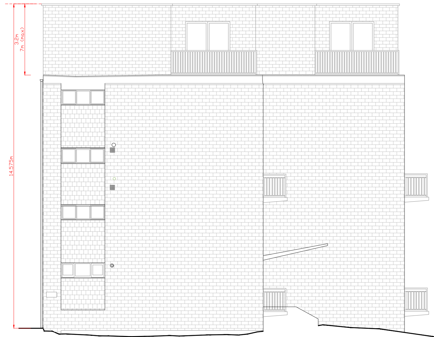
PROPOSED LEFT SIDE ELEVATION (D) Scale @ 1/100